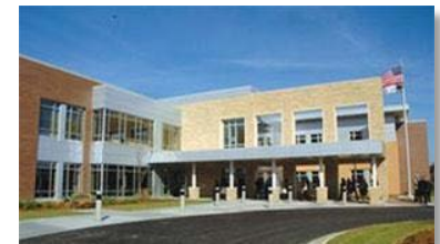
Behavioral health facility located in Raleigh, NC operated by UNC Health Care as of 2013