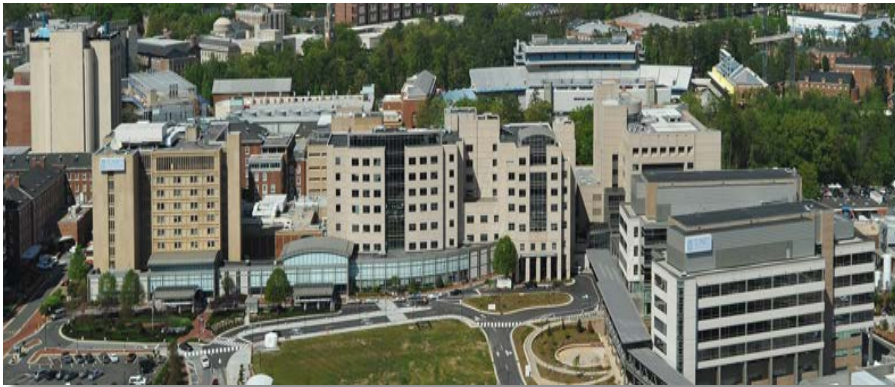
Academic Medical Center in Chapel Hill with outpatient services across North Carolina