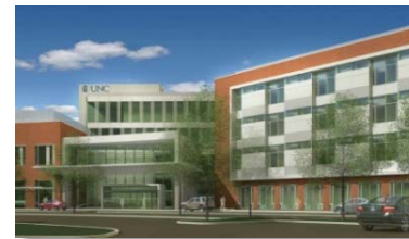
Community hospital in Hillsborough opened July 2015 and Medical Office Building opened in 2013